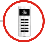
Prox Tag Reader Set/unset from a tag on your key-chain