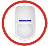
Internal Detectors A wide range of detectors available: including grade 3 & pet detection