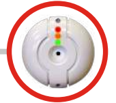
Break Glass Sensor Protecting windows from intrusion