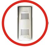
External Detectors Protecting the perimeter