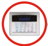
Keypads For multiple entry points