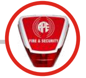
External Sounders An audible and visual deterrent