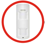
TMD Grade 3 dual technology internal detector

Wired Peripherals Available for Your Home